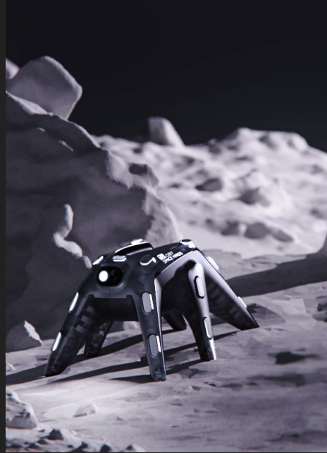
" Space hand "

Lunar robot Final Project Industrial Design Gregory Paskalov